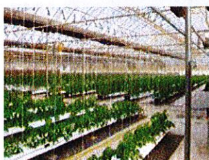
Nursery or Greenhouse (planting, potting, pruning, watering, harvesting, etc.)