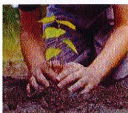
Forestry (soil preparation, planting, growing, cutting trees, etc.)