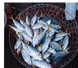
Fishing & Fish Processing (catching, sorting, packing, transporting fish, etc.)

If you answered "yes" to the questions above, please continue below. Otherwise, your form is complete.