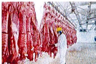
Processing & Packing (fruit, vegetables, chicken, eggs, pork, beef, lamb or other livestock, etc.)