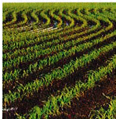
Agriculture or Field Work (planting, picking, sorting crops, soil preparation, irrigation, fumigation, etc.)